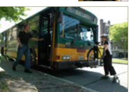
U-PASS members took 9.4 million trips on King County Metro in the 2011-12 Academic year, accounting for 8% of all King County Metro trips.